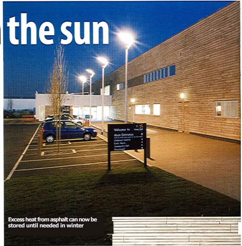
Excess heat from asphalt can now be stored until needed in winter

The Carbon Trust was instrumental in part funding the design of the ICAX Ltd IHT system. Fulcrum Consulting were the building services consultants